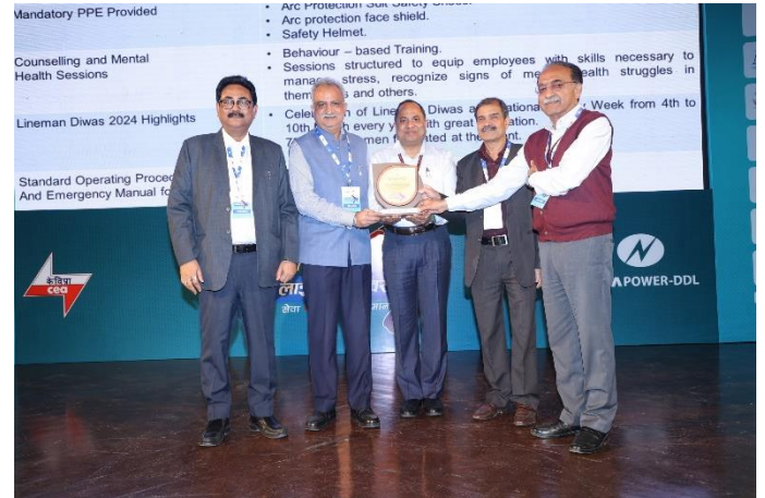
High-performing DISCOM Recognition