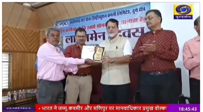
Felicitation of Lineman at CSPDCL