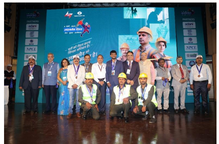
Felicitation of Linepersons at the event