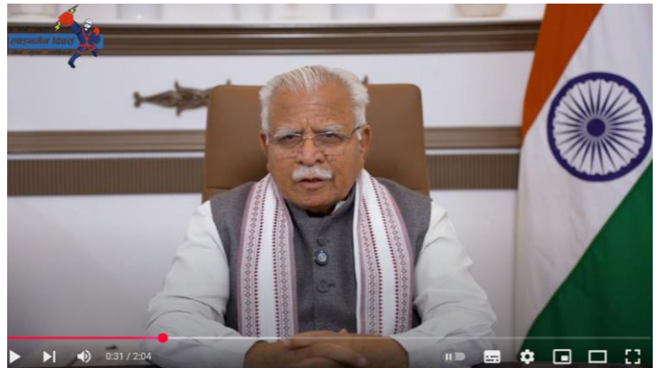
Special video message from Sh. Manohar Lal, Hon'ble Cabinet Minister of Power and Housing & Urban Affairs