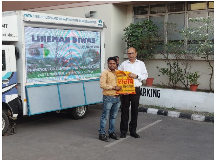
Felicitation of Lineman at Tata Steel, Jamshedpur