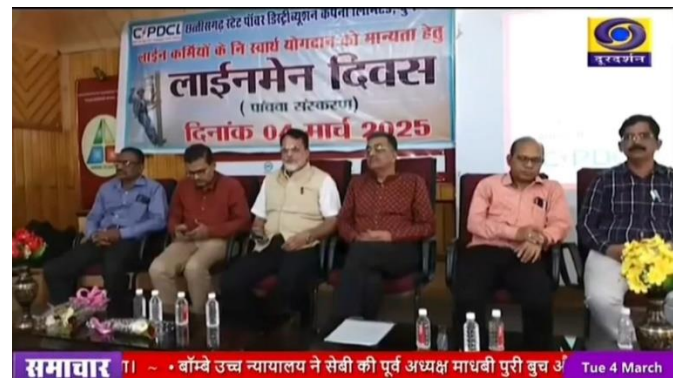
Lineman Diwas event at Chhattisgarh State Power Distribution Company Limited (CSPDCL)