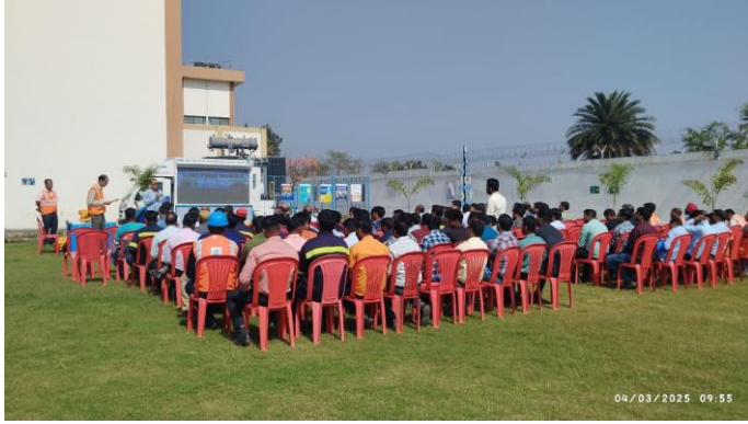
Lineman Diwas event at Tata Steel, Seraikela & Kharsawan, Jharkhand