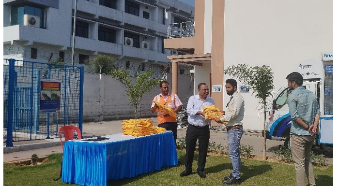
Felicitation of Lineman at Tata Steel