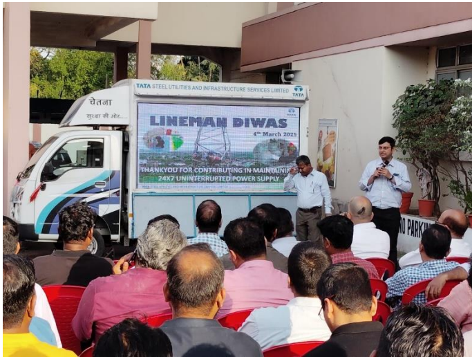
Lineman Diwas event at Tata Steel, Jamshedpur, Jharkhand