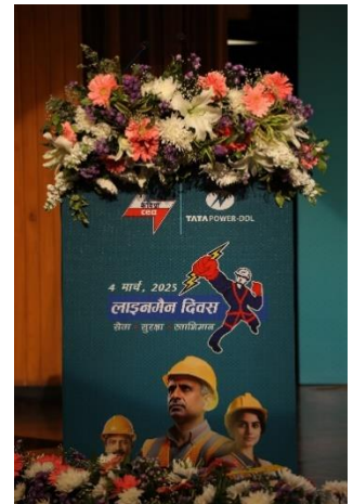
Lineman Diwas celebration at locations in India