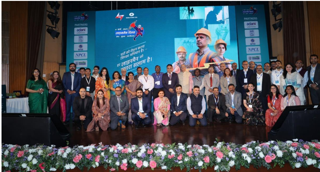
Organising Team of CEA and Tata Power-DDL