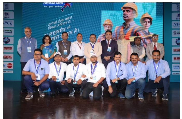
Felicitation of Linepersons at the event