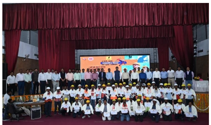
Felicitation of Lineman at KESCO