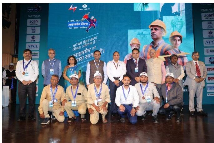
Felicitation of Linepersons at the event