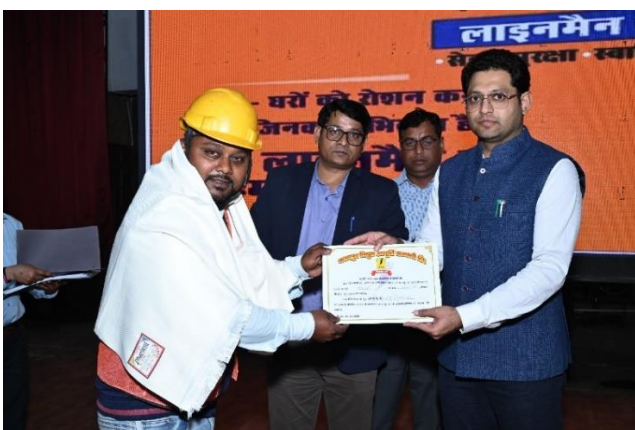
Lineman Diwas event at Kanpur Electricity Supply Company (KESCO)