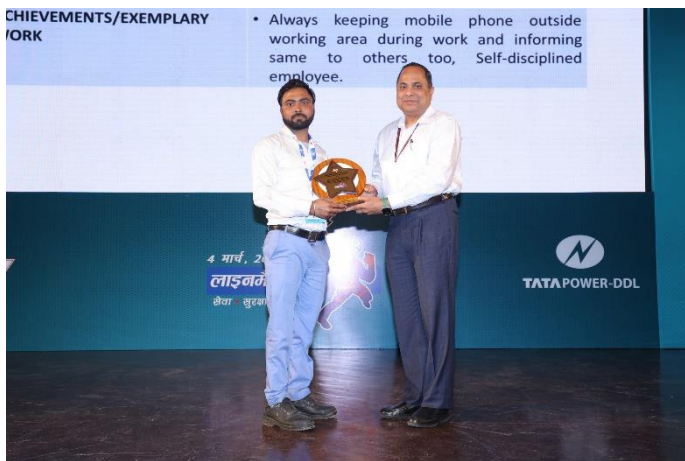
Best Lineman Recognition