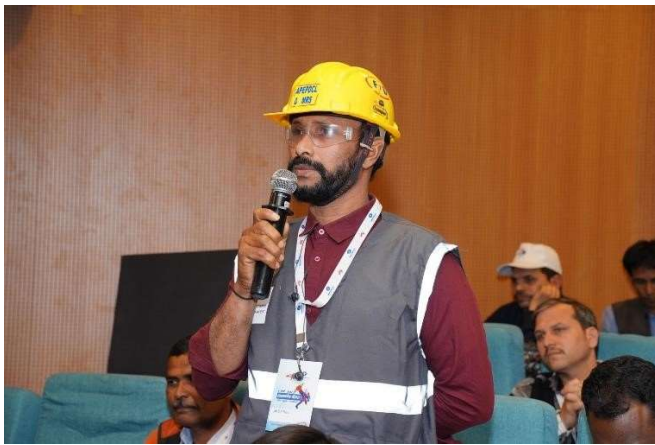
Lineman sharing his experience