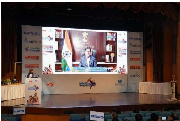
Special Video Message from Sh. Raj Kumar Singh, Minister of New and Renewable Energy, Govt. of India