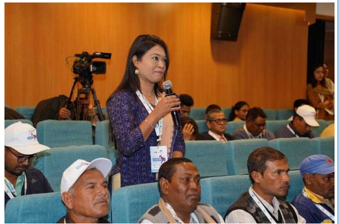
Linewoman sharing her views