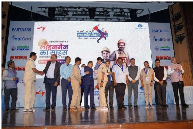
Felicitation of Linemen at the event