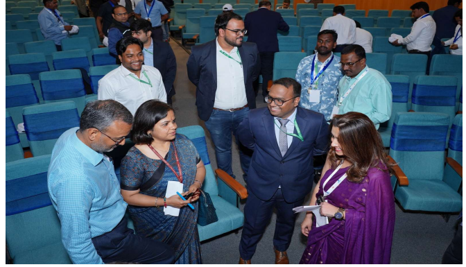
Organising Team Members