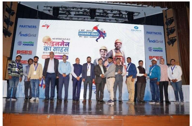
Felicitation of Linemen at the event