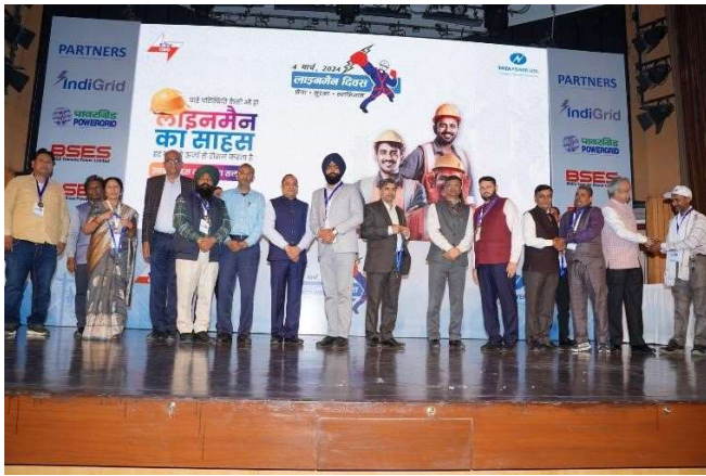
Felicitation of Linepersons at the event