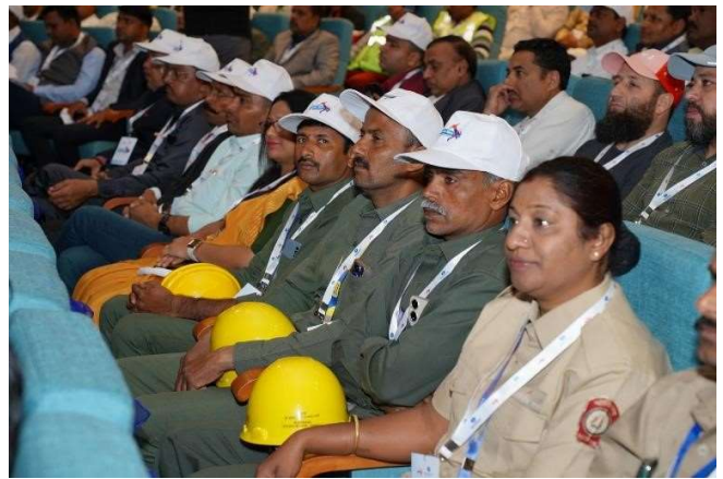
Linepersons at the event