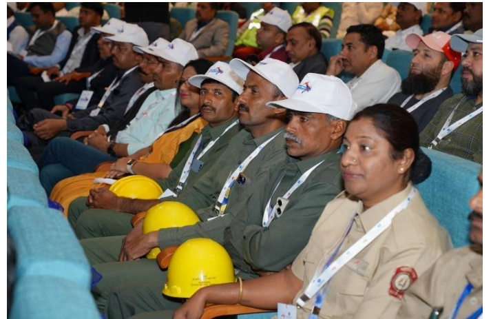
Linepersons at the event