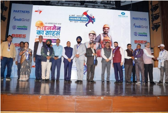
Felicitation of Linepersons at the event