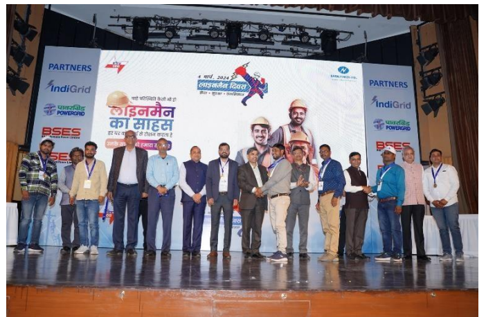
Felicitation of Linemen at the event