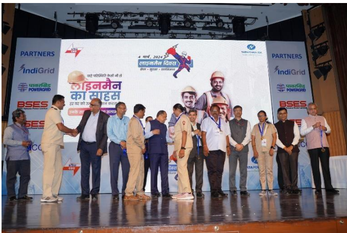
Felicitation of Linemen at the event