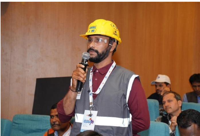
Lineman sharing his experience