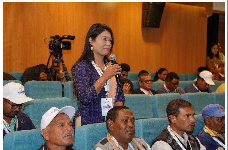
Linewoman sharing her views