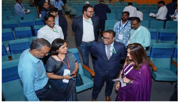
Organising Team Members