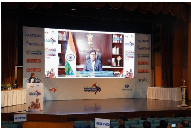
Special Video Message from Sh. Raj Kumar Singh, Minister of New and Renewable Energy, Govt. of India